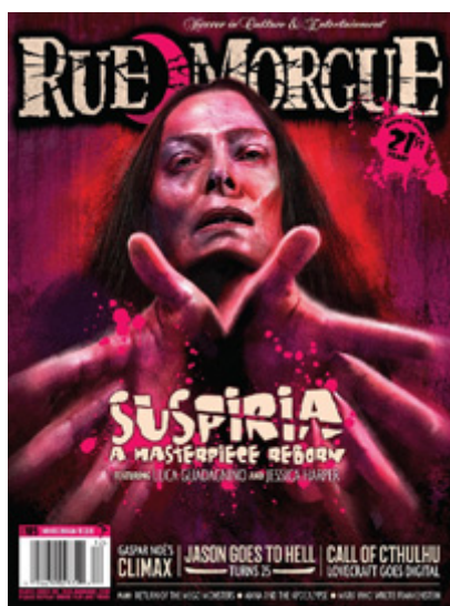
Rue Morgue #185