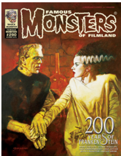
Famous Monsters #290