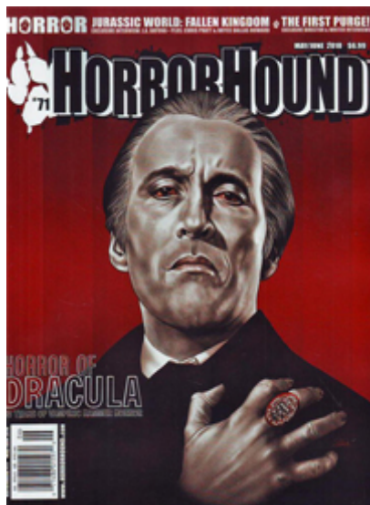
HorrorHound #71 by Sara Deck