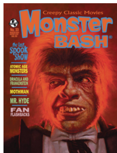
Monster Bash #33