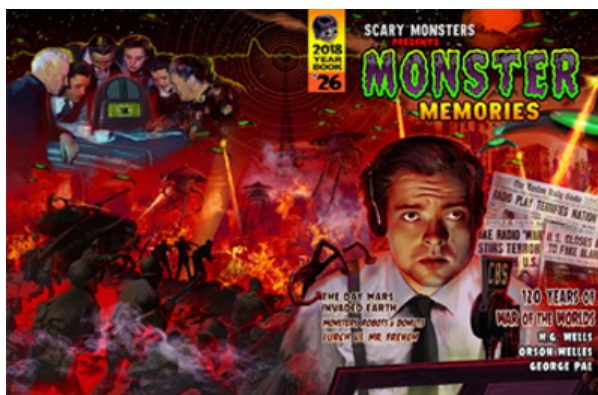
Scary Monsters Presents Monster Memories #26