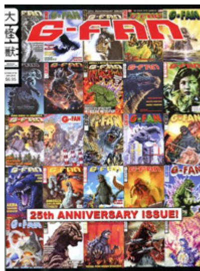
G-Fan 25th Anniversary