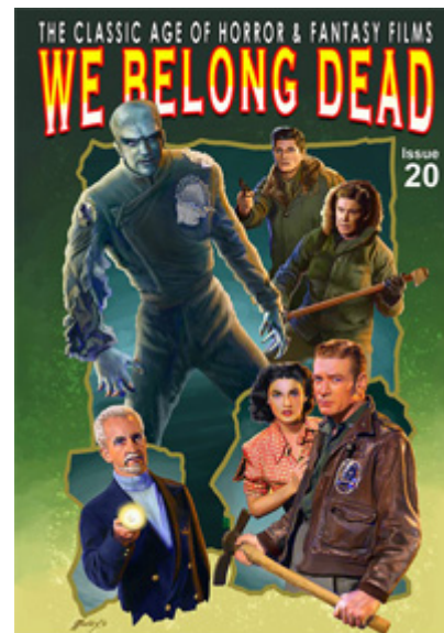
We Belong Dead