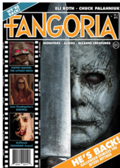
Fangoria Vol. 2 #1